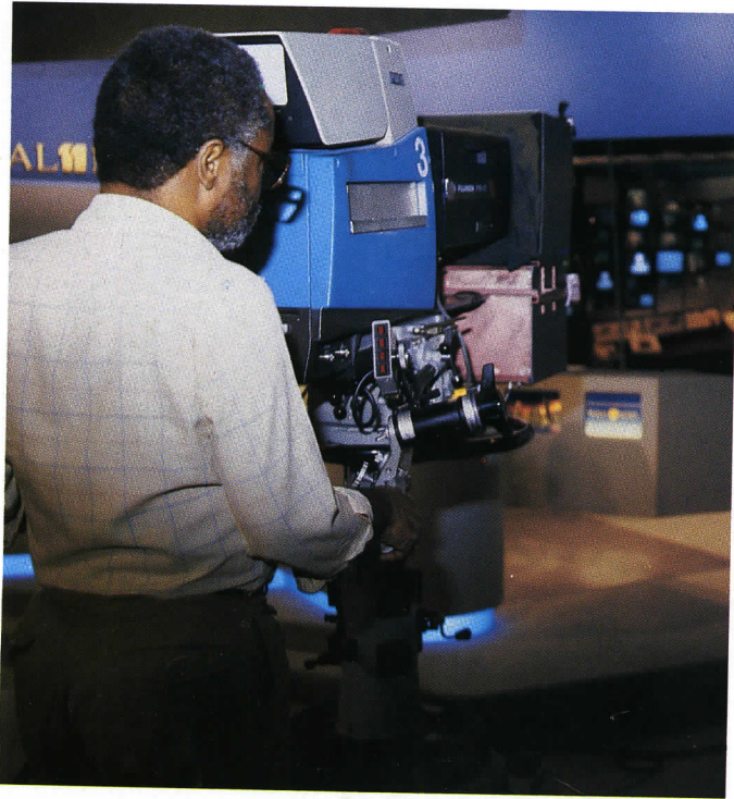
Fig. 2-8. Studio camera technicians are responsible for shooting and/or recording studio programs. They must be able to understand and carry out instructions. (WBAL-TV, Channel 11, Baltimore, MD)